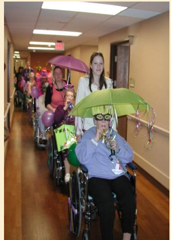
Right: Residents and Staff participating in the Mardi Gras parade.