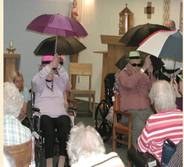
Left & Above: The Mother of Mercy Precision Dance Team dancing to classics such as “Singin’ in the Rain” and to songs by artists such as ZZ Top.